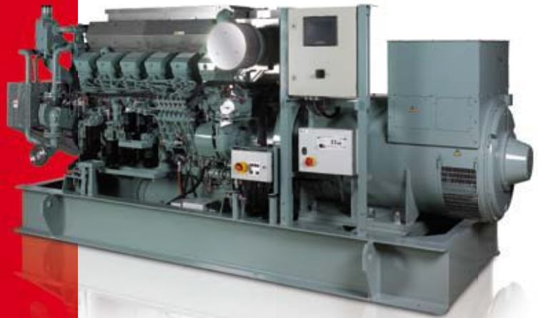
Mitsubishi Auxiliary Sets